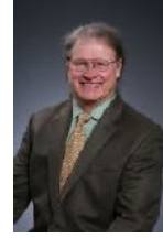
Northern Nevada Right to Life State Director