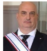
State Membership Director