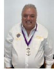
Grand Knight Council #12877