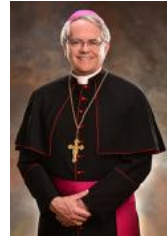
Third Bishop of Las Vegas Roman Catholic Diocese of Las Vegas

We are excited to announce that the Annual Diocesan Conference registration website is live.