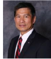
Immediate Past State Deputy & Supreme Director