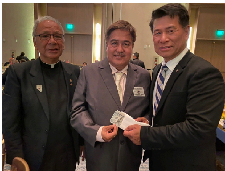
Giving donation to Visayas Jurisdiction for the Pump Boat Project to benefit the 2021 Typhoon Odette Victims.